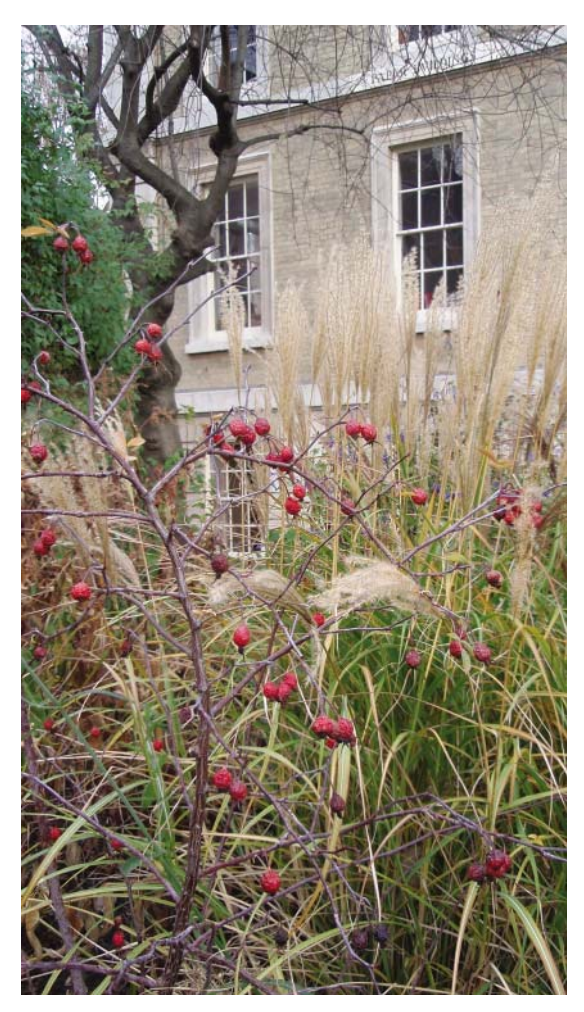
Rose glauca with Miscanthus sinensis 'Undine'

I'm proud to say that the Inner Temple Garden was rated 'Excellent' in 2010 by the London in Bloom Trustees. An even greater accolade is that we have been recognised by the City of London as having contributed to their having won Gold in the Britain in Bloom awards and Gold for sustainable landscaping in the City in Bloom awards.