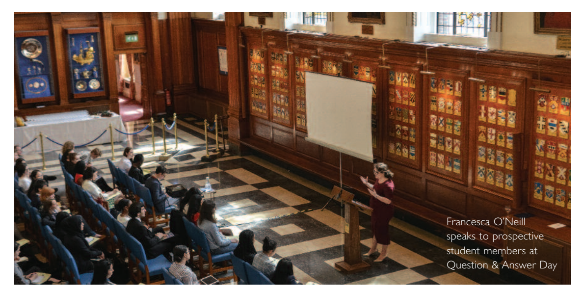
Students meeting practitioners at Question & Answer Day

where students were able to meet and speak informally with members of the Inn. Thanks go to all the members of the junior Bar who volunteered at this event.