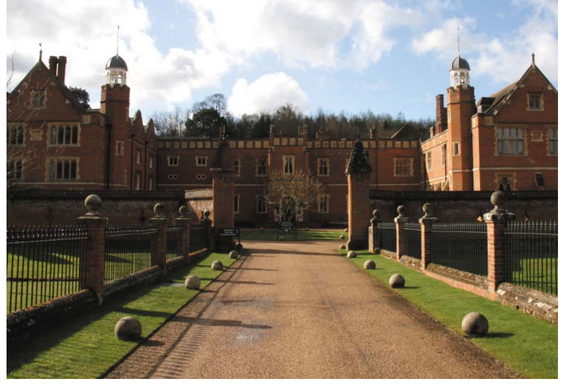
Wotton House - New Practitioners' Weekend