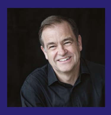
Tuesday 3 October 2017 7pm Parliament Chamber, Inner Temple