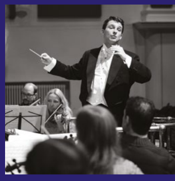
Wednesday 11 October 2017 7pm Middle Temple Hall