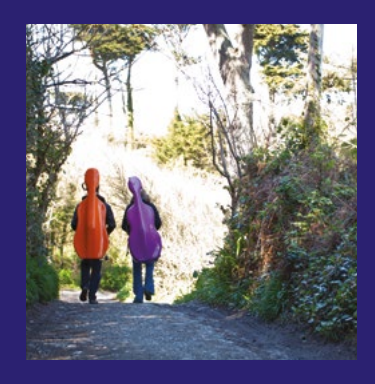
Monday 6 November 2017 7pm Parliament Chamber, Inner Temple