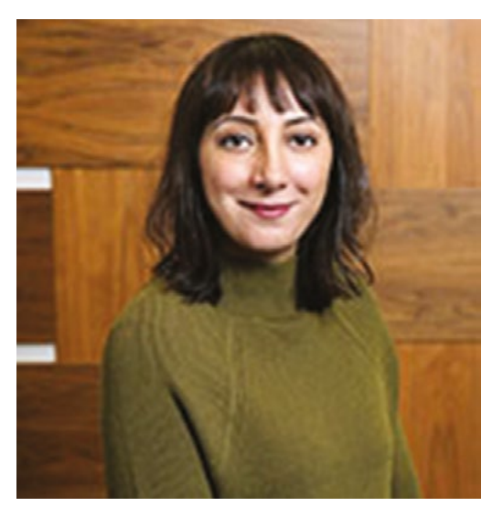
MONDAY 13 NOVEMBER

'Sales' on Retention of Title Terms: A Tale of Caterpillars, Bunkers and the Supreme Court