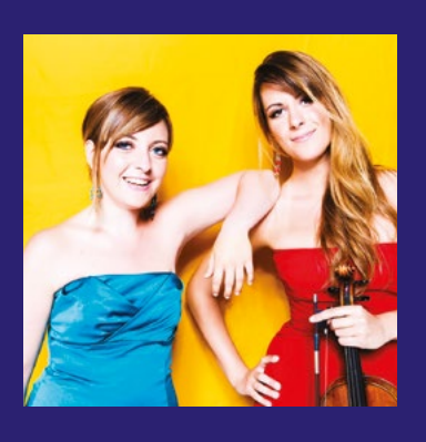
Tuesday 31 October 2017 7pm Temple Church