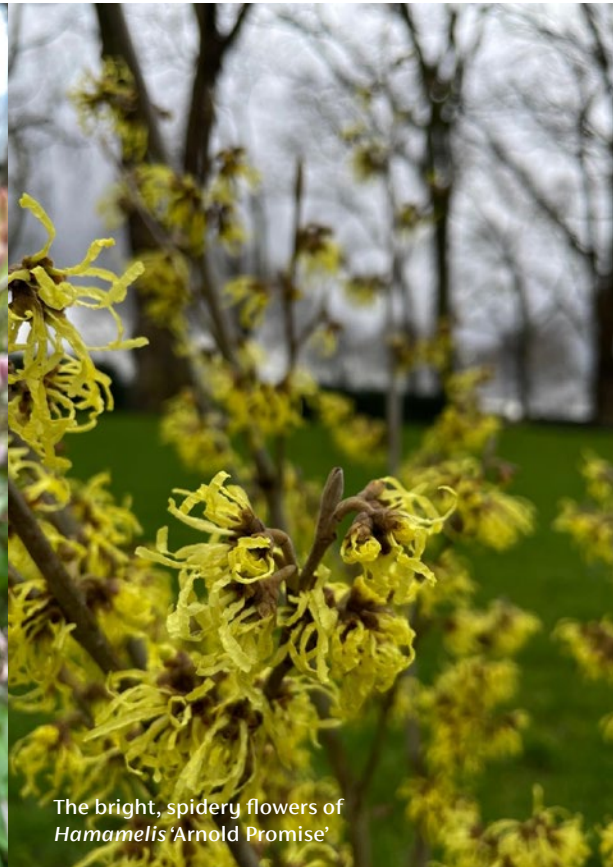
The bright, spidery flowers of Hamamelis 'Arnold Promise'