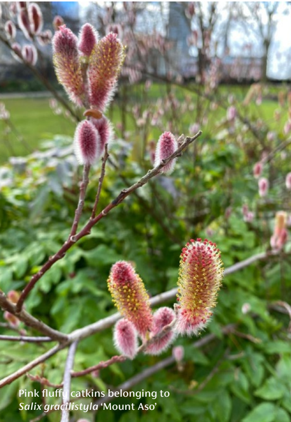
Pink fluffy catkins belonging to Salix gracilistyla 'Mount Aso'

One of my favourite plants, however, is our winter flowering honeysuckle, Lonicera x