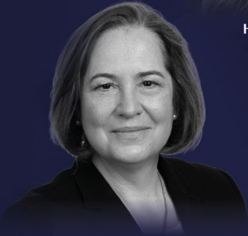
The Rt Hon Lady Justice May DBE