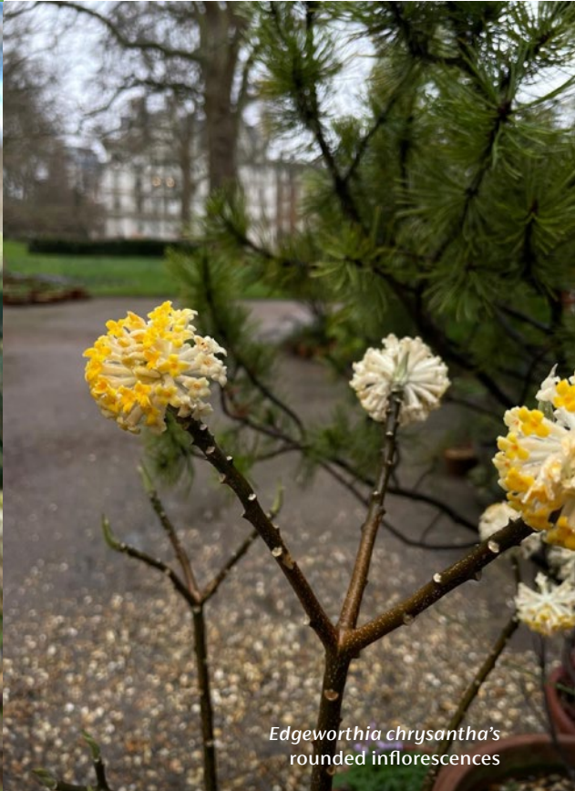
Edgeworthia chrysantha 's rounded inflorescences