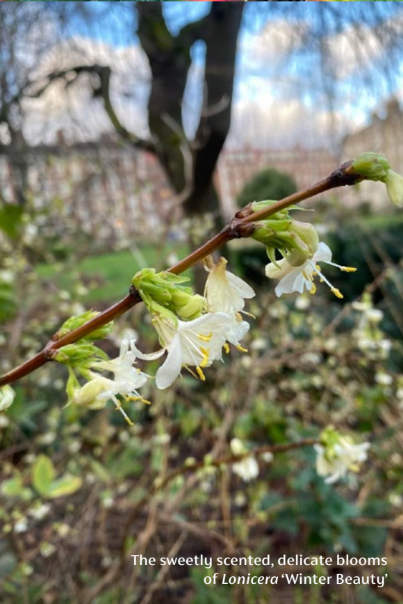
The sweetly scented, delicate blooms of Lonicera 'Winter Beauty'

The appearance of these flowers with intoxicating scents in the depths of winter evoke the promise of spring's imminent arrival, and with it the reawakening of nature. A reminder that a new year is beginning.