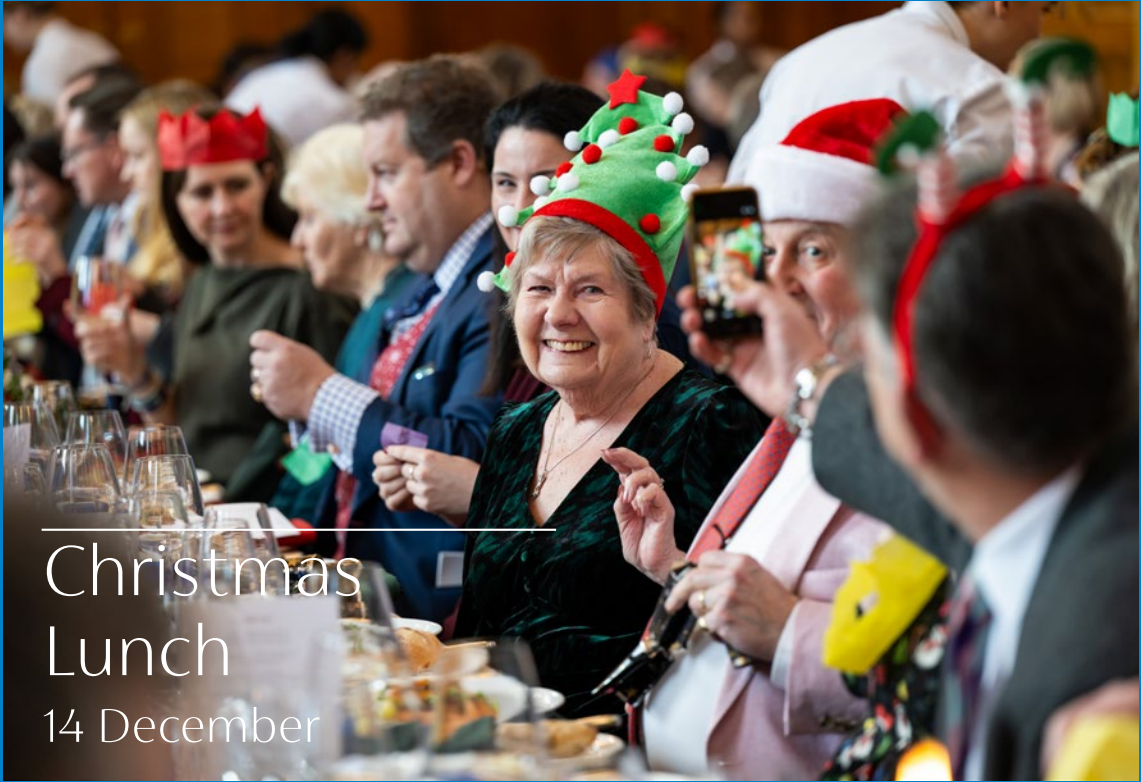
Christmas Lunch 14 December