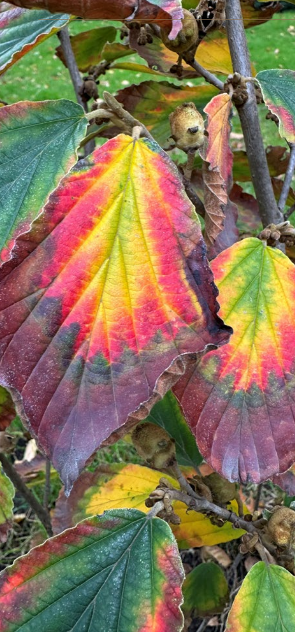
The vibrant autumn colours of Hamamelis 'Arnold Promise'

purpusii 'Winter Beauty'. Particularly loved by bumble bees it provides a valuable nectar source when all else is scarce. It is semi-evergreen, so retains some of its foliage throughout winter and produces creamy white tubular flowers that smell delicious! Lonicera purpusii is a cross between L. fragrantissima and L. standishii both originating from China. These winter honeysuckle early blooms symbolise resilience and hope, two qualities in short supply on a damp dark day in January.